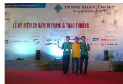
The NTU Team - Beach Star

With outstanding performances, the NTU team - Beach Star-NTU - won the third prize among 85 strong teams from other universities, colleges and institutions.