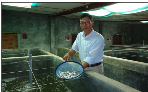
Baby yellowfin - butterfishes are raised in experimental concrete tanks