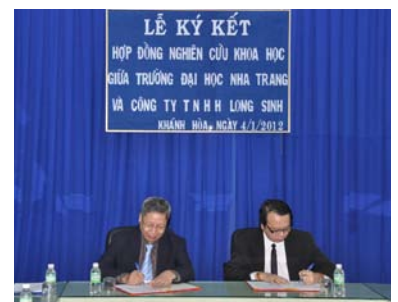
Signing research contract with Long Sinh Ltd. Company

Research cooperation with Long Sinh Co.,Ltd. In January, 2012, NTU signed a contract with Long Sinh Co., Ltd to conduct a research on chitosan. NTU will receive financial support from Long Sinh to carry out the study and experiment the production of chitosan. In addition, the Company will provide scientific materials related to the testing of chitosan on plants and some fisheries subjects. As for Nha Trang University, this is one of the activities that it promotes as regards the application of scientific research to solve real-life problems.