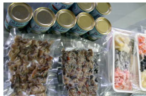
Salted sea cucumbers and frozen smoked dried sea cucumbers

Sea cucumbers are a highly-nutritious seafood but not quite well known to consumers because of their complicated cooking-preparation. In order to help consumers better exploit the nutritional value of sea cucumbers, a research team led by MSc. Tran Thi My Hanh has implemented the project "Processing value-added products from sea cucumbers" and recently introduced three ready-to-cook sea cucumber products, including salted sea cucumbers, frozen smoked dried sea cucumbers and salted sea cucumber soups.