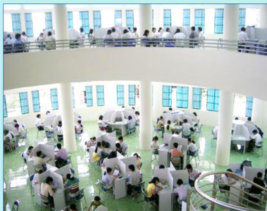
NTU library - Studying room

With an area of over 12,000 meters square, the Library of Nha Trang University is now serving thousands of NTU faculty, staff and students for their research and training needs.