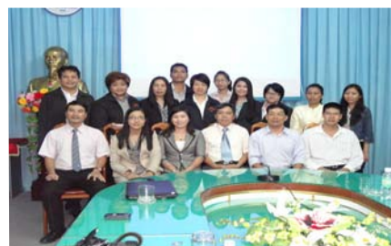
Trainees from Udon Thani Rajabhat University with NTU staffs.

From 11th to 31st of March, 2012, NTU held a training course on "Aquatic Products Processing Technology and Food Safety" for 10 officials from Udon Thani Rajabhat University, Thailand. The course was to provide the attendants with basic knowledge of aquatic products processing technology, food safety issues and hands-on experiences through experiments and site visits of some aquatic product processing enterprises in Khanh Hoa Province.