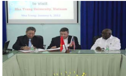
Leaders of Nha Trang University and Auburn University signed the Collaboration Agreement (January 6th, 2012).

International Cooperation. NTU has established co-operations with more than 10 universities and research institutes from developed countries over the first semester of academic year 2011 – 2012. Auburn University and the University of Connecticut from the United States, and Far Eastern Federal University from Russia are some to name. The cooperation agreements mainly target at scientific research, technology transfer, personnel training and scholar exchange.