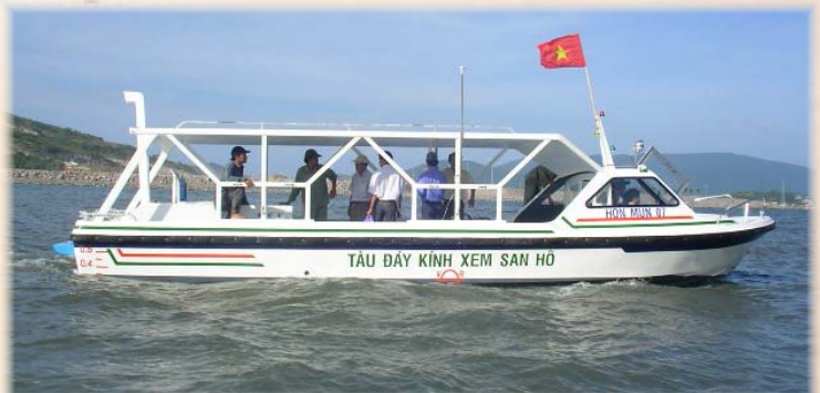
Glass Bottom Boat