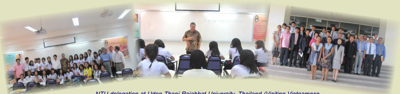
NTU delegation at Udon Thani Rajabhat University, Thailand (Visiting Vietnamese class and taking photos with leaders of Udon Thani Rajabhat University)

NTU in March; to send a teacher from NTU to teach Vietnamese at UDRU in June; and to exchange students majoring in tourism. In addition, NTU is planning to attend the 90 th anniversary ceremony of UDRU in November 2013.