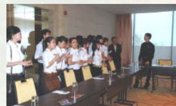
Field trips for students of Foreign Languages Faculty