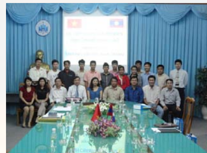
Welcoming undergraduate students from Laos

October 9 th , 2012: 10 students from Laos arrived at NTU for their undergraduate studies in economics and accounting at NTU. A ceremony was held to welcome the students and leaders of the Provincial Committee, Department of Education, and Department of Foreign Affairs of Champasack Province. These students will be granted full scholarships for four years by Khanh Hoa Province which has developed sistership with Champasack Province for several years. Various economical, political, cultural and educational exchanges between two provinces have taken place, thereby enhancing solidarity and deepening relationships between Vietnam and Laos.