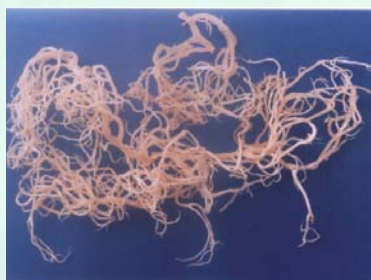
Cold dried carrageenan