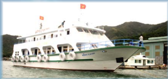
King Yatch Tourist Boat