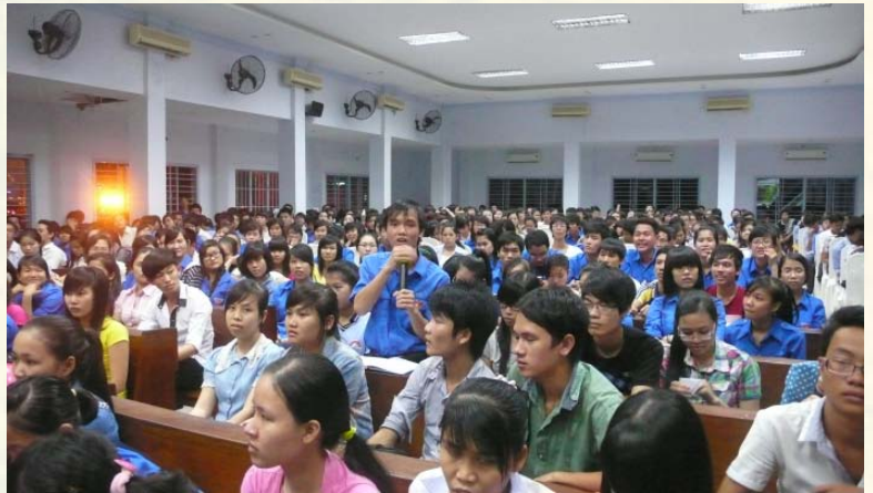
Hundreds students participated in the discussion

Students were excited and satisfied with the discussed issues, and they wish to have similar activities in order to exchange the problems and situations they encounter daily.