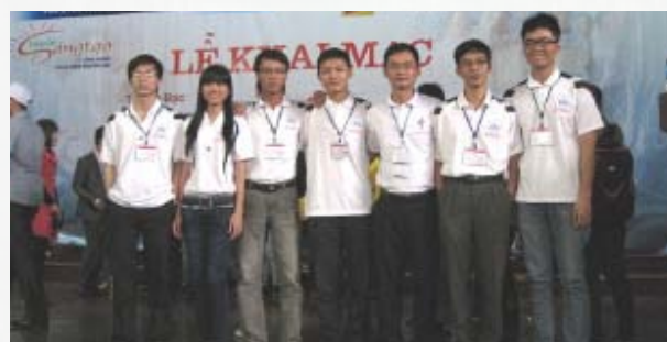
NTU's IT Team