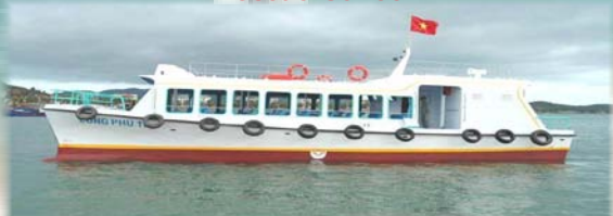
Catamaran Tourist Boat