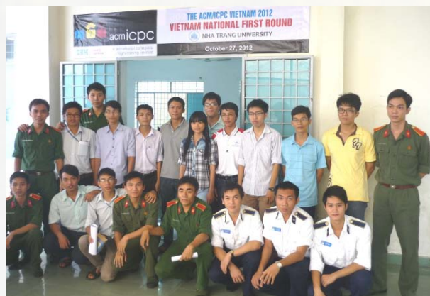
IT Teams from Information Officers School, Navy Academy, and NTU

On September 28 th at Hanoi University of Industry, the 21 st IT Olympics for students of Viet Nam was held with the participation of over 800 students from information technology and communication majors from universities and colleges across the country. NTU sent teams to take part in the competition and achieved a third prize and an encouragement prize for competing amongst IT major students.