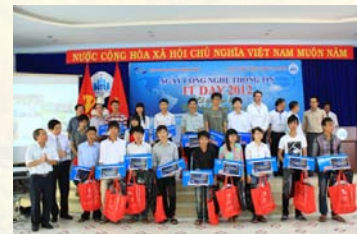
NTU students participating in IT Day and receiving scholarship from sponsors