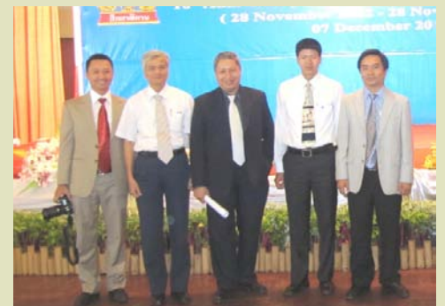
NTU delegation at Champasak University, Laos

In Thailand, the delegation visited Udon Thani Rajabhat University (UDRU). The two sides discussed and agreed on a specific exchange agenda for 2013. Among the activities are to organize a Vietnam-Thailand cultural exchange event at