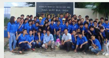
Students of Food Tech. Faculty visiting Viet Duc Brewery and Beverage Factory