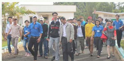
Students of Biotech and Environment Institute visiting Da Lat Nuclear Research Institute