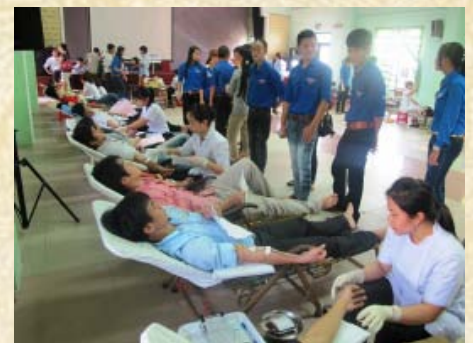
More than 1,000 students participated in blood donation event

“Voluntary blood donation” activity is held regularly. This activity demonstrates the meaning of humanity and strong sense of community to help patients in hospitals. In addition, it helps students to show responsibilities to the community, and upholds the tradition of “solidarity” of the Vietnamese people.