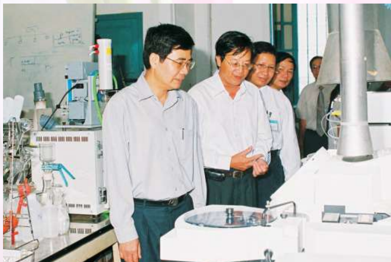
Mr. Cao Duc Phat, Minister of Agriculture and Rural Development, on his visit to The Institute for Biotechnology & Environment

The Institute for Biotechnology and Environment, formerly known as the Central Laboratory, was established in 1992. Over 21 years of construction and development, to date, the Institute possesses a team of highly qualified staff (including 1 Assoc. Prof, 3 PhDs, 10 Masters, 19 Bachelors) and a system of intensive and modern labs for majors in microbiology, biochemistry, biotechnology and environment technology.