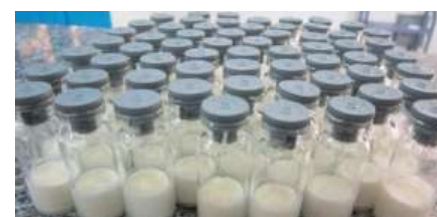
Probiotics after freeze-drying