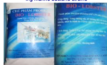
Probiotics Bio - Lobster 1 and 2