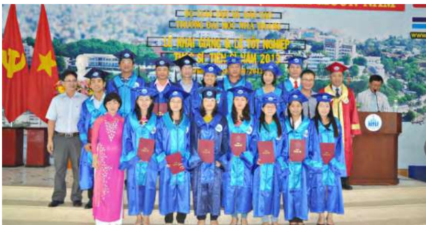
New Masters of Economics Faculty with NTU leaders