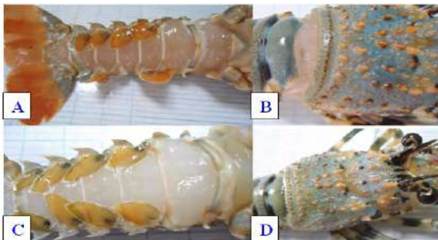
External distinctive signs of the 2 experimental groups of lobsters: One infected with V. owensii DY05 (A+B) and the control sample (C+D)

The project results have enriched the collection of bacterial strains with antagonistic activity against Vibrio causing diseases in aquatic animals, helping successfully determine the protocol for producing freeze-dried probiotics for lobsters. This has also been the first report in the world to confirm that Vibrio owensii DY05 can be a pathogen in ornate spiny lobsters in their post-larvae stage.