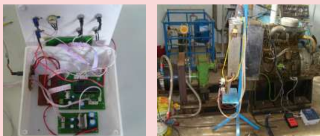
The successfully manufactured controller (left) and the experimental layout in reality on Yanmar 4CH engine at the Department of Internal Combustion Engine

Based on theoretical research and practical testing on Yanmar engine - 4CH, the parameters, in accordance with the research objects, were determined to successfully build an automatic throttle fuel controller; the device operated stably, could be easily switched between manual and automatic mode, easily changed to any value in the allowed range of speed and exhaust gas temperature. The controller also performed well for safety monitoring and automatically throttling down in case of overload.