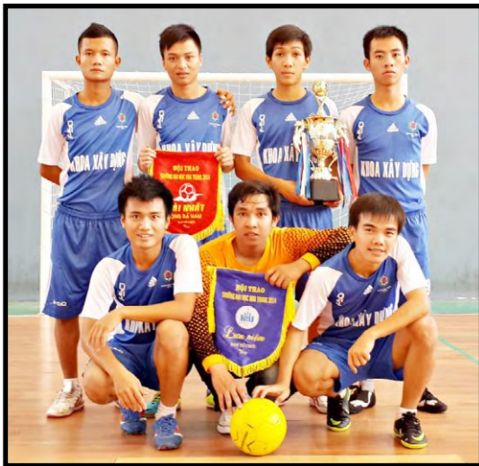
Male football team of Faculty of Civil Engineering

The YU of the Civil Engineering Faculty won the 1 st prize for male football, the YU of the Food Technology Faculty won the 1 st prize for female football and volleyball, the YU of the Mechanical Engineering Faculty won the 1 st prize for male volleyball.