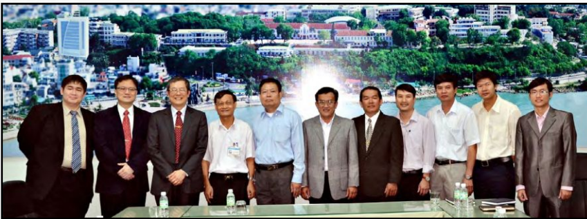
Faculty's leaders and delegation from National Taiwan Ocean University

The Faculty currently has cooperation in training and scientific research with many domestic and international organizations such as Hyundai Vinashin Ship Building Factory, Dung Quat Shipyard, Ulsan University (South Korea), Norwegian University of Science and Technology (NTNU), The Australian Maritime College (AMC), National Taiwan Ocean University (NTOU), etc.