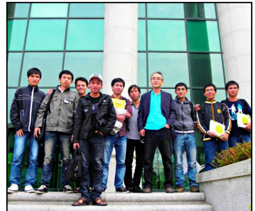
Students of the Faculty studying in Korea